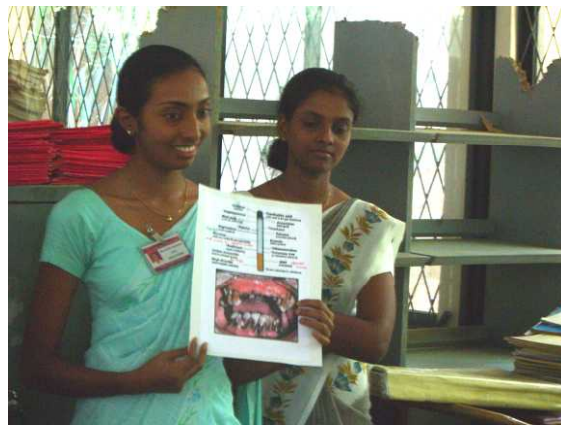
Oral health education focused on modifying risk behaviours related to the use of tobacco