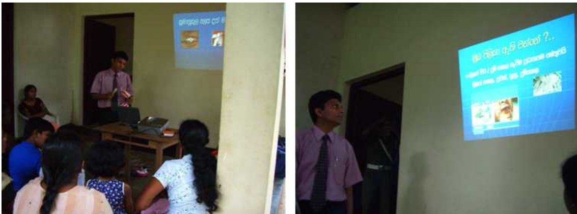
Oral hygiene instructions provided using a projector by a senior dentist from the University of Peradeniya